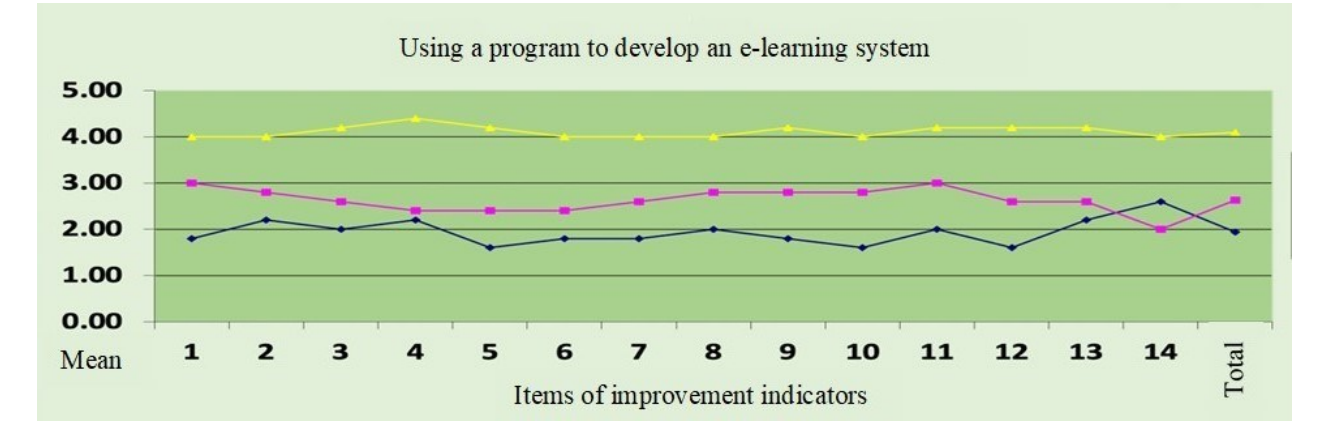
Figure 1. The Changes in the Identified Indicators Arising from the Development: The Program's Application in the Development of E-learning Systems